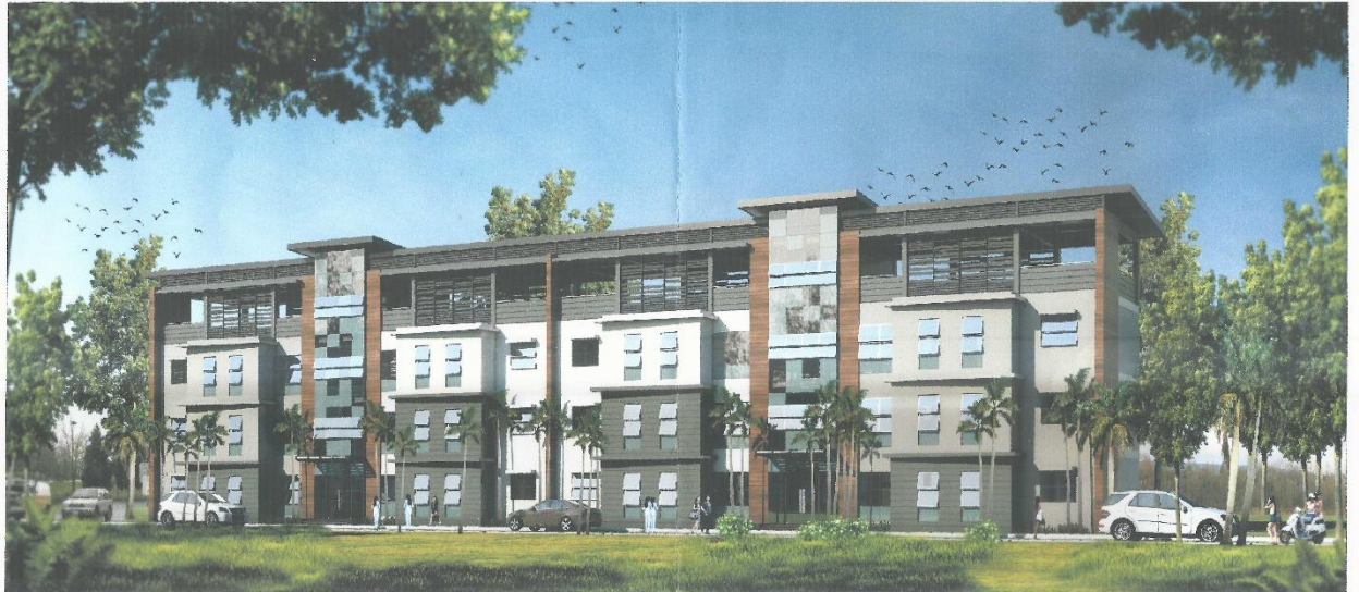
1 A-1 EXTERIOR PERSPECTIVE