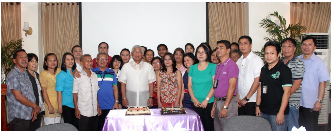
Defense Secretary Voltaire T. Gazmin with the recipients of the DND Long Service Award and the November birthday celebrators at the DND Social Hall on November 29, 2013.